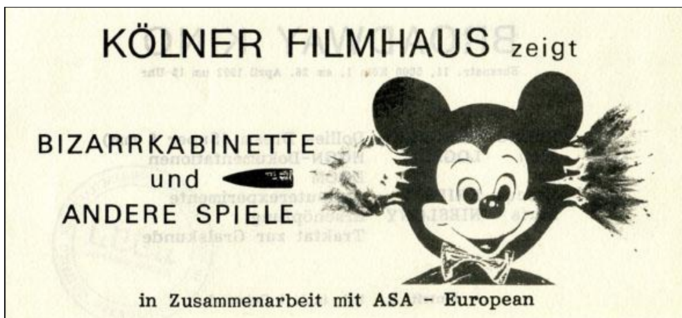
Broadway Kino, Cologne, 1992