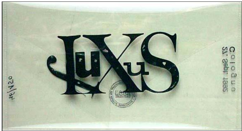
Fluxus / 'luxus (Ultimate Akademie)